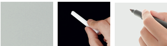
MH/E6 HGL/MAT*/AGT**/ MPM/SMT